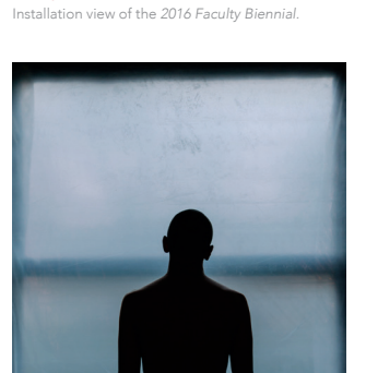
Rana Young: The Rug's Topography Untitled (silhouette) from The Rug's Topography 2016. Archival pigment print, 30 x 22.5 inches.