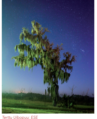
Terttu Uibopuu: ESE Tree at night, 2014. Archival pigment print, 42 x 32 inches.